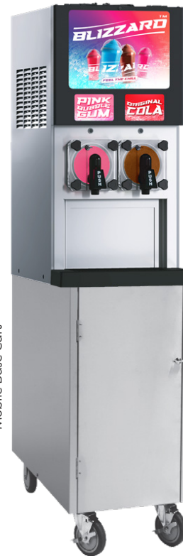
Mobile Base Cart